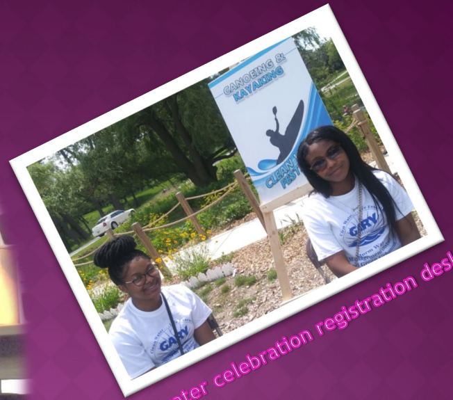
Clean water celebration registration desk