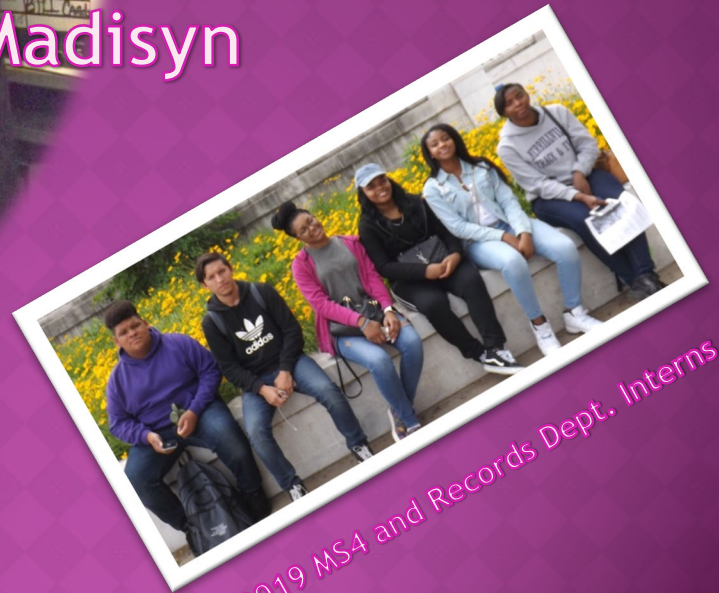
2019 MS4 and Records Dept. Interns